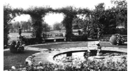
The rose-garden pond at Brackenhurst Hall in the 1930s