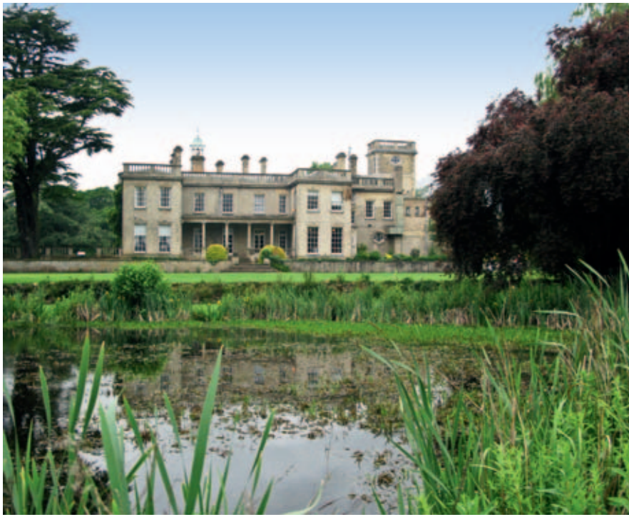
The dew pond at Brackenhurst Hall, which was constructed in 1928, is a fine example of a pond with significant ecological and historical value in a formal garden setting.

It is important to remember that too much pond vegetation can have a detrimental impact and can cause undesirable chemical changes such as daily oxygen depletion. Ideally, a pond with approximately 35 per cent open water and 65 per cent vegetation cover during late summer is recommended, as some species require areas that are relatively plant-free. Newts for example need areas of open water to mate.