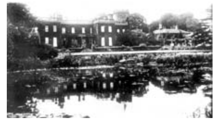
Brackenhurst Hall and dew pond in the early 1930s

Prior to its merger with Nottingham Trent University, a lack of resources during the latter half of the 20th century led to some of the garden features falling into a state of neglect. Fortunately, the development of horticultural courses on the campus provided the expertise and labour to start to restore the gardens.