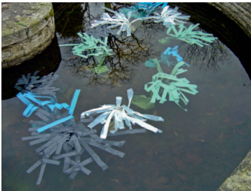
The rose-garden pond in 2005 supports a small breeding population of great crested newts. The pond is leaking (hence the low water levels), but is due for restoration as part of a larger project to restore the rose-garden. The stripped and weighted plastic bags provide newts with alternative egg-laying substrate and will be replaced with suitable plants once restoration work is completed. A brick ramp is installed in the pond during summer to allow young amphibians to escape.

damaged dew pond lining was removed and replaced by a butyl liner and the water control structures were repaired. All of the work was supervised by a licensed ecologist (a requirement of the English Nature licence) and any animals encountered (including the newts) were trapped and removed to suitable habitat elsewhere in the gardens.