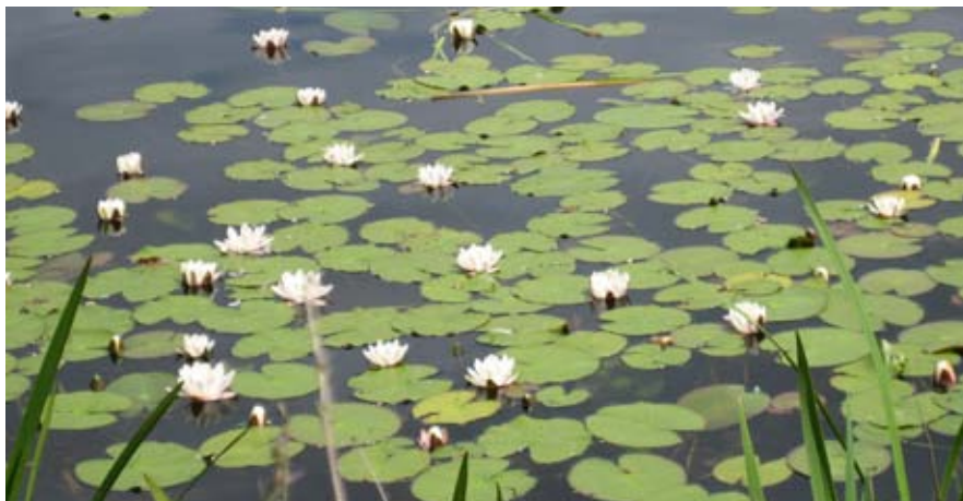
Water-lilies are a familiar site in ponds, lakes, canals and slow-flowing rivers, but most populations of white water lily Nymphaea alba in Britain are not native. However, stands of any water-lily species in a pond can provide excellent habitat for pond fauna including great crested newts. However, the ecological value of a pond will decline, if the majority or the entire pond surface is covered by water-lily pads. This is because the heavy shade will suppress the growth of other plant species. In addition, dense stands of water-lily can reduce the area available for male newts to display and attract females. Therefore, management of aquatic plants is usually essential to maintain the long-term ecological interest of a pond.

To some extent, a lack of native species in a garden environment can be offset by complex plant architecture. In general, the more diverse the plant structure, the greater the range of opportunities that organisms can exploit. In the case of a pond this can mean that a diverse range of emergent, floating-leaved and submerged aquatic plants is best.