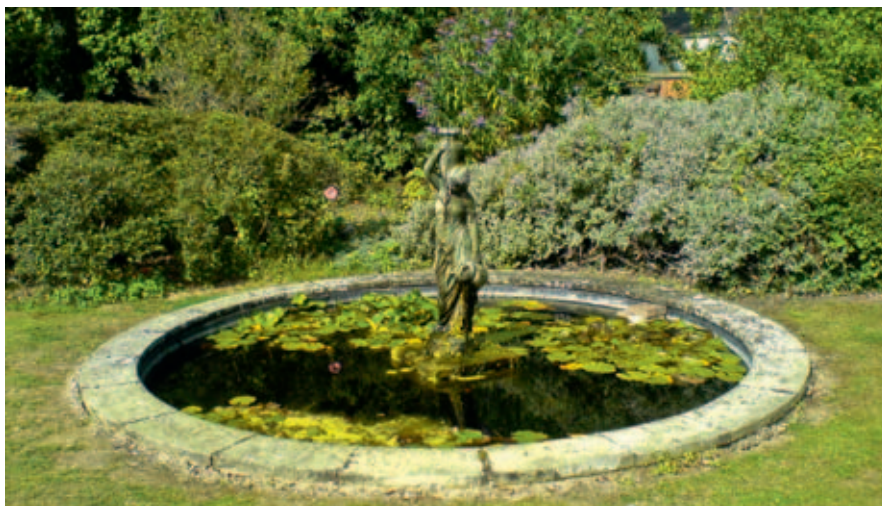
The pond above is located in the grounds of Walton Manor, a 16th century building at Milton Keynes. It is a plastic-lined pond set within a formal landscape of paving, mown lawns and ornamental shrubbery that is approximately 4m in diameter and 0.75m in depth. This pond contains medium-size populations of great crested newt (peak count of 29 adults) and smooth newt (peak count of 45 adults) and common frog has also been recorded; most importantly the pond does not contain any fish species. The newts lay their eggs on the water-lily (genus Nymphaea ) pads and strands of filamentous algae.