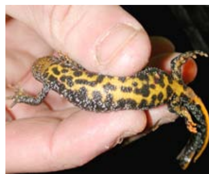
A male great crested newt, captured during post-restoration monitoring of the Brackenhurst dew pond. The distinctive belly patterns are unique to each adult and can be used to identify and track the fate of individuals during future monitoring events.

Many ponds in historical landscapes will contain populations of fish. These ponds