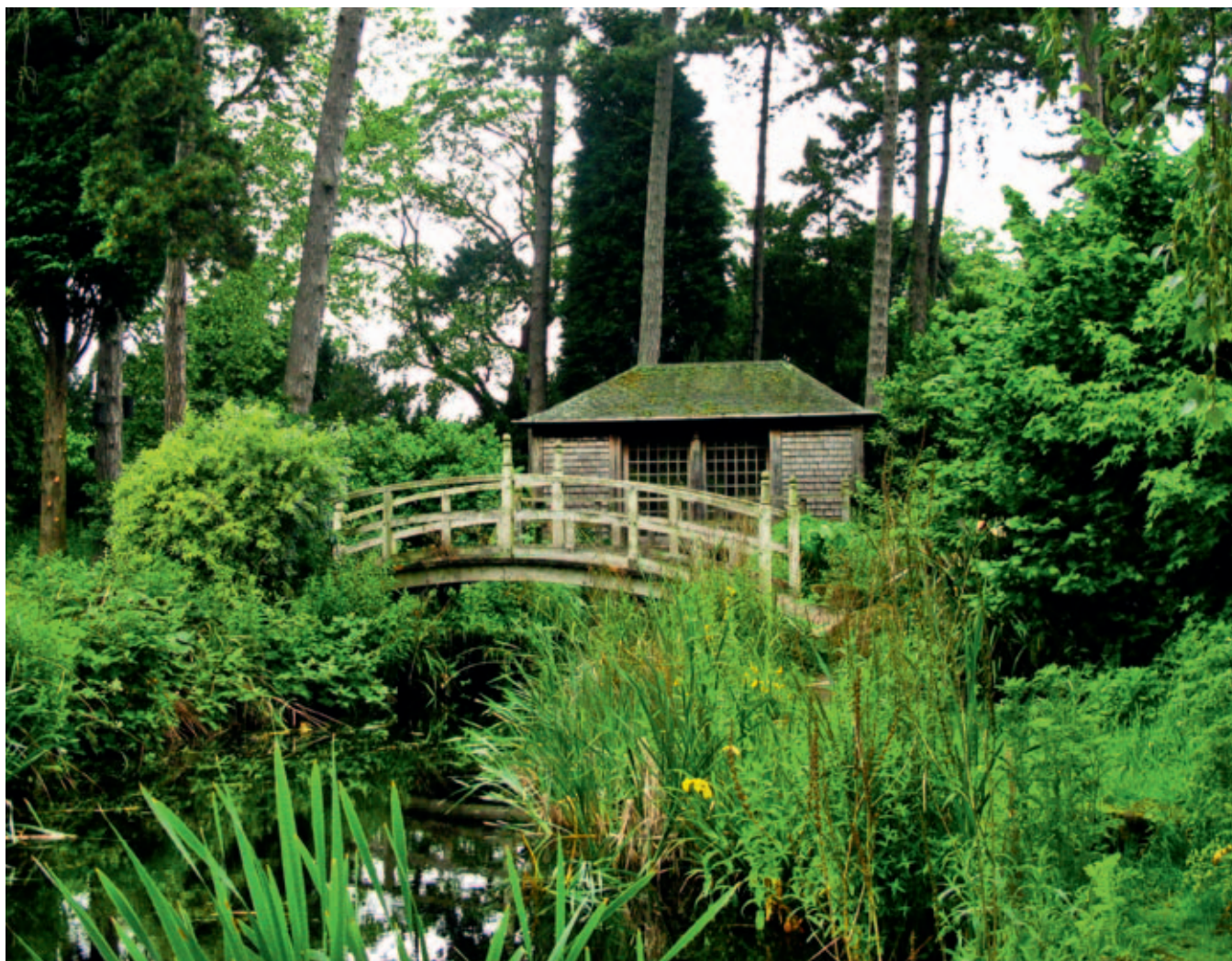
The boathouse and willow-pattern bridge at the east end of the dew pond three years after restoration. Marginal vegetation has developed further, but the channel is being annually cleared of floating and submerged vegetation to provide male great crested newts with sufficient open water to display to females during courtship.

The small stone-lined ponds in the gardens continue to support breeding amphibians, so any work such as masonry repairs, vegetation clearance and cleaning are carried out during winter. During the amphibian breeding season brick ramps are temporarily placed into two of the stone-lined garden ponds that have vertical sides. The ramps allow young amphibians to leave the ponds and are subsequently removed towards the end of summer when young amphibians have left the pond.