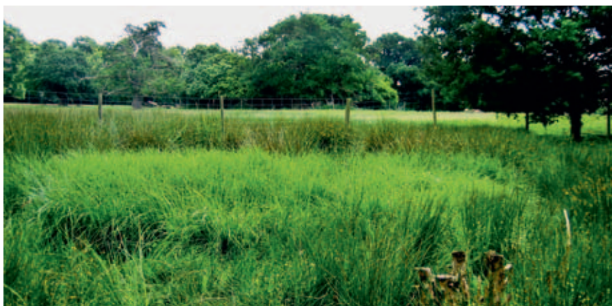
The photograph above shows a pond in the latter stages of natural succession at Cotswold Wildlife Park, a process whereby standing water-bodies gradually infill with silt and debris, and change to wetland, then ultimately to terrestrial habitat. The pond shown is now dominated by bottle sedge Carex rostrata in the centre, with hard rush Juncus inflexus and marsh bedstraw Galium palustre on the margins, and could be classified as a wetland rather than aquatic habitat.

Although ponds such as this can support amphibians, they are sub-optimal for breeding purposes, because of a lack of open water for display. Unless there is good reason, ponds with a complete cover of wetland rather than aquatic plant species should not be restored by removal of vegetation and silts because wetlands are often as valuable as ponds and will support a different biological community to that which is typically associated with ponds. In all cases, a survey should be carried out before any management is implemented.