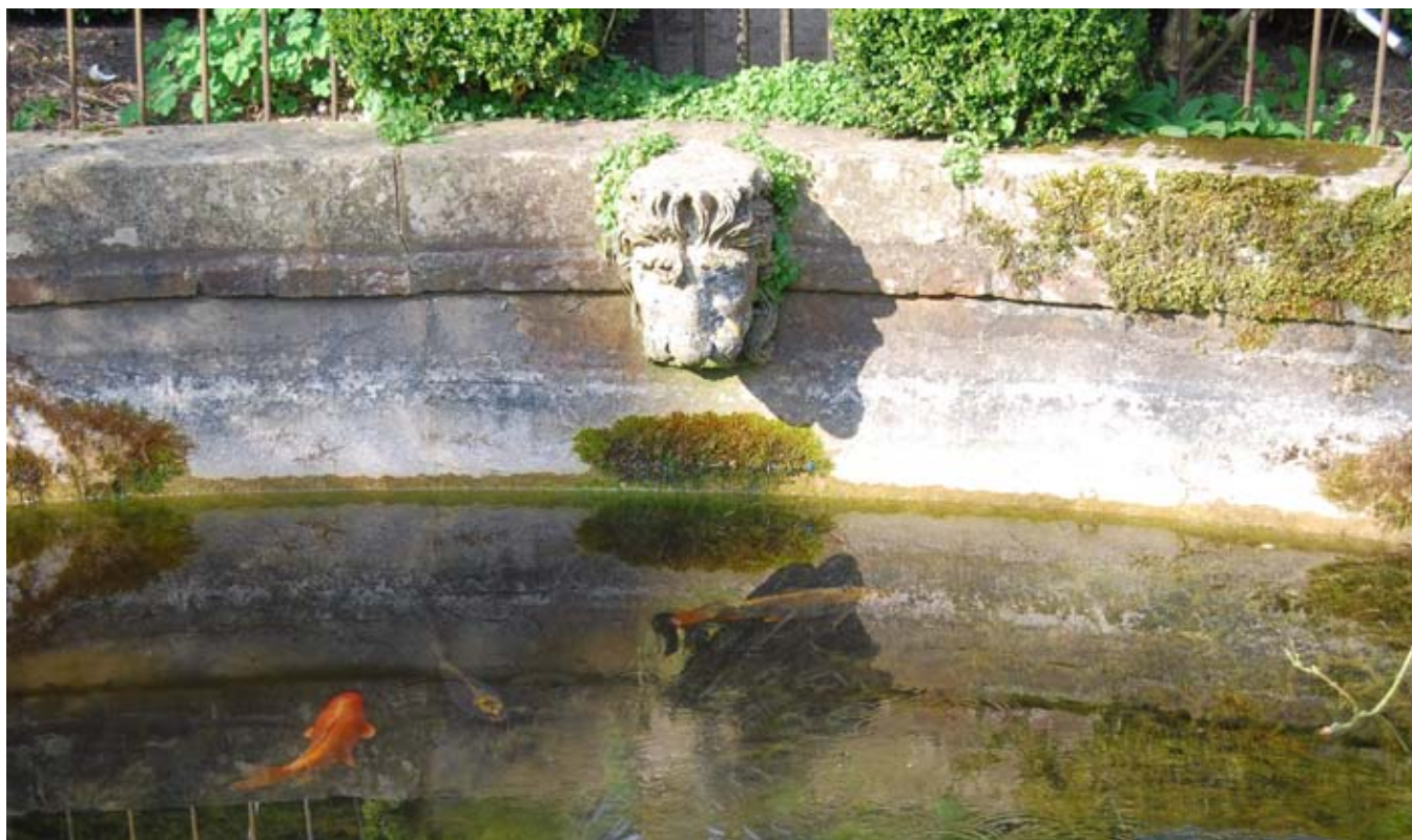
A typical stone-lined 19th-century ornamental garden pool: regular silt clearance for the fish limits the diversity of species that the pond can support.

In 1999 the Pond Conservation Trust estimated that there were approximately 400,000 ponds in Britain. 1 Ponds are important not only as a unique resource for biodiversity, an amenity for a wide range of interests, and a visual focus in many landscapes, but also because they form a key part of the culture and history of Britain. An estimated 98 per cent of the ponds in lowland Britain are of artificial origin and were created for a wide range of agricultural, industrial and ornamental purposes.