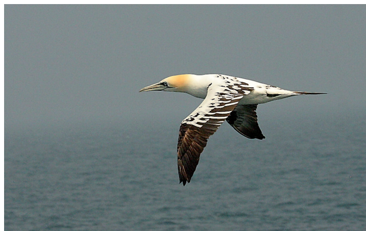
Gannet Morus bassanus – Gannets were seen to take active avoidance of the OWF